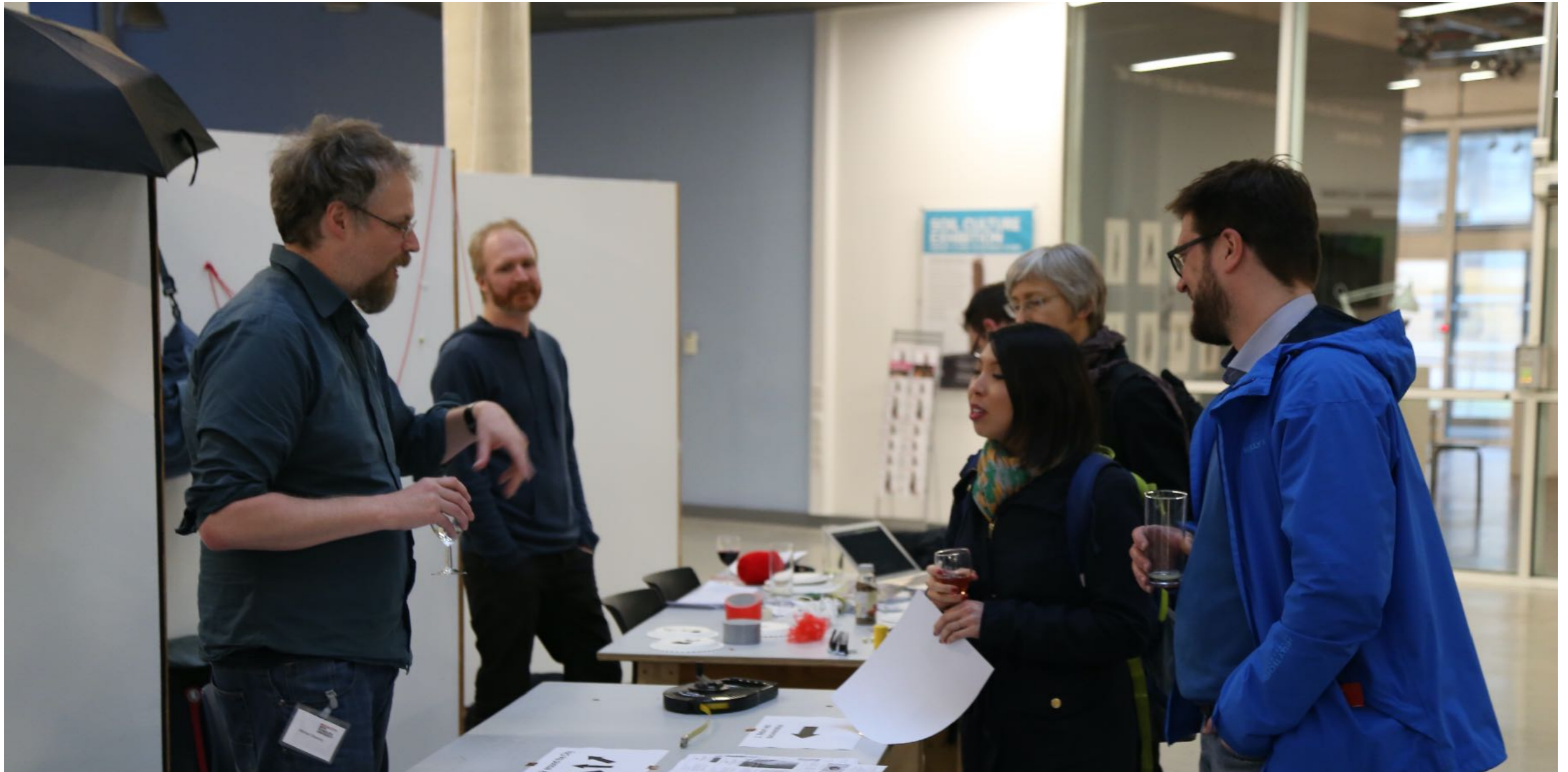
PFIP at Mediacity 5